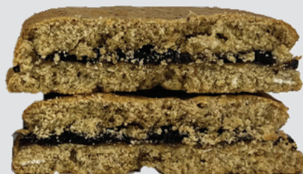
High Protein Test with LEVAIR® Fortify