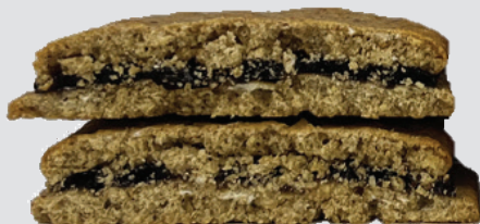
High Protein Control

achieves greater volume and softer texture in bars fortified with 30% more protein